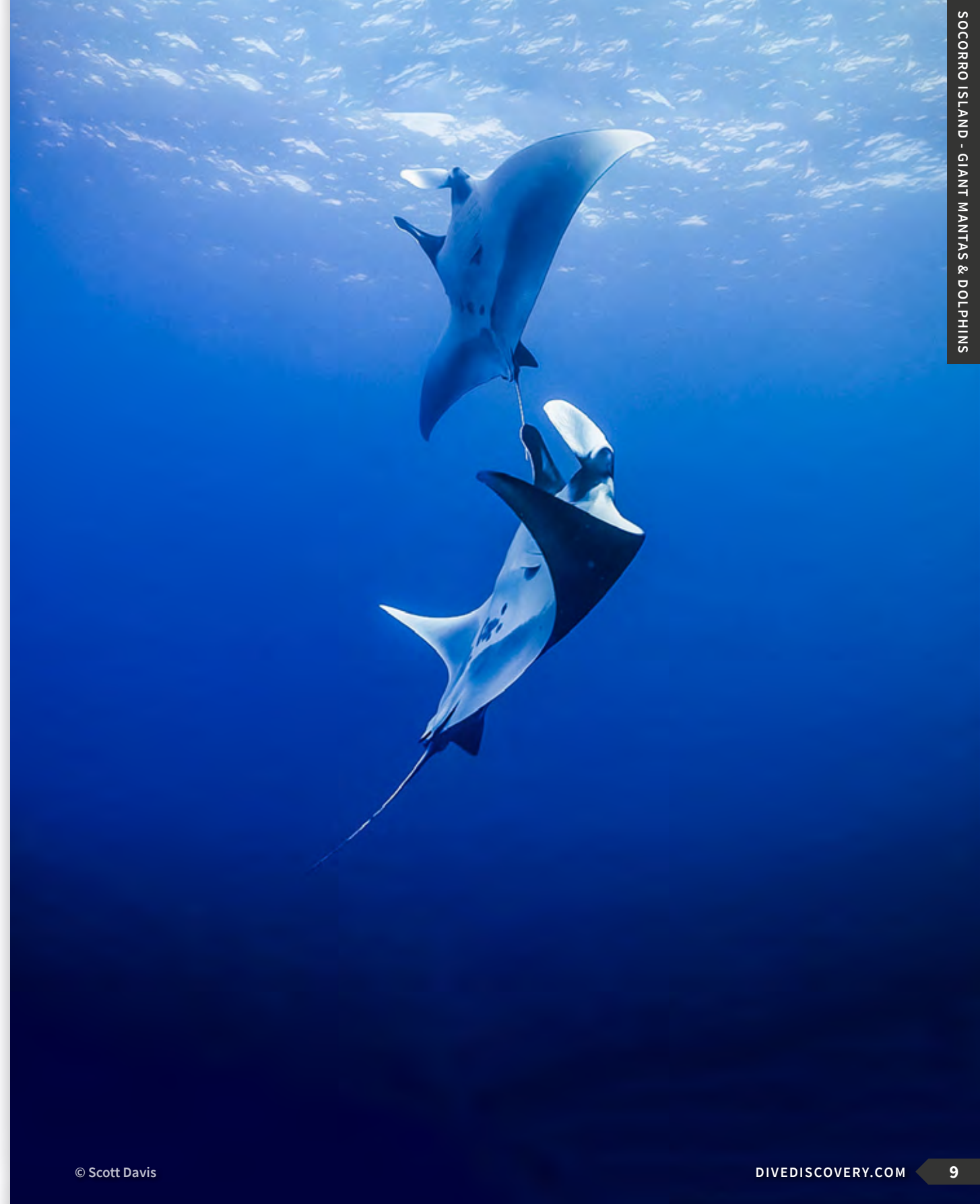
SOCORRO ISLAND - GIANT MANTAS & DOLPHINS